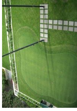
Roof top gardens and greens

The owner installed 114 new low-flow toilets (1.6 gallons per flush), resulting in a 60% savings per flush. One-gallon flush kits installed on 37