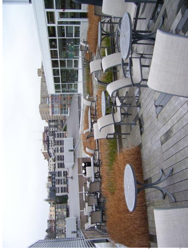
Alley24 East seating area on the roof