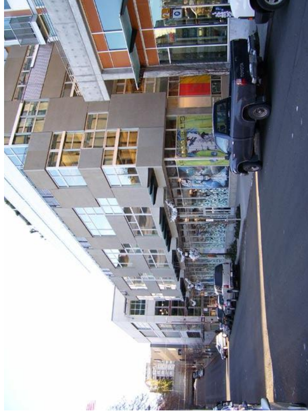
The east pedestrian entrance at Alley24 East

A growing number of market analysts, investors, and owners believe that energy characteristics and building performance will play a significant role in the determination