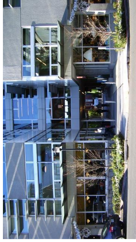
Streetside retail view