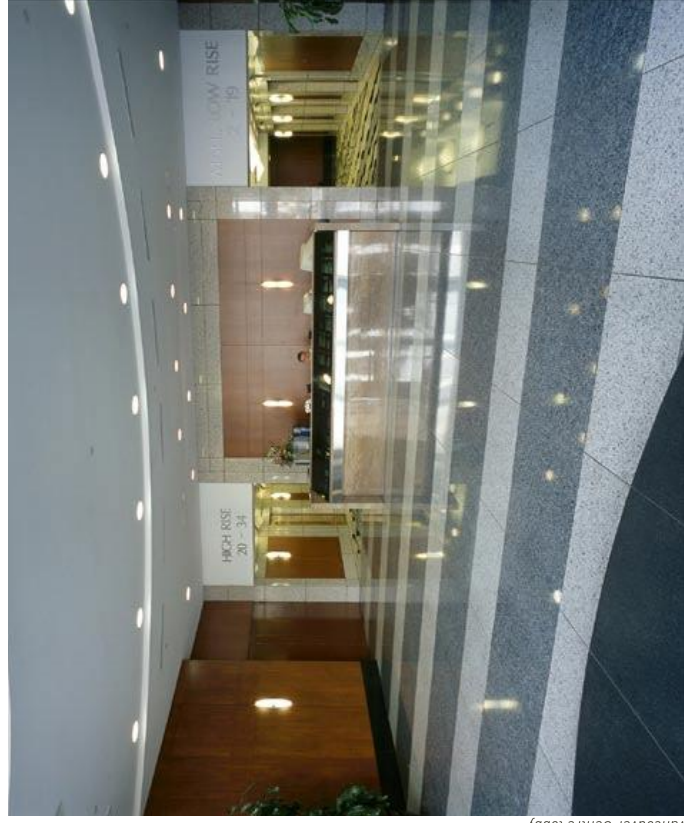
Vancouver Centre lobby

This study identified that the lease structure affected who paid for sustainable attributes and who benefited. This is the so-called green lease issue, in which differences of payment, benefit, and ownership result in questionable advantage to the owner in undertaking a retrofit.