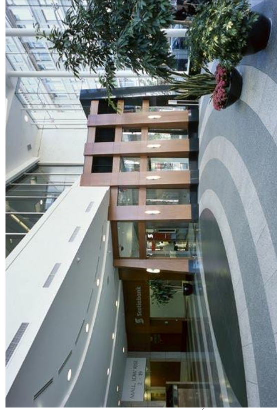
Vancouver Centre lobby