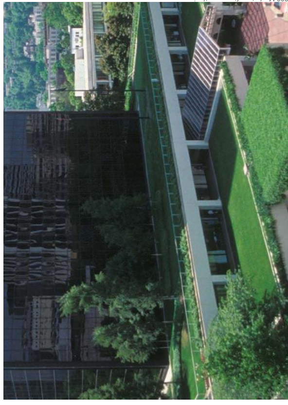
200 Market rooftops, north view