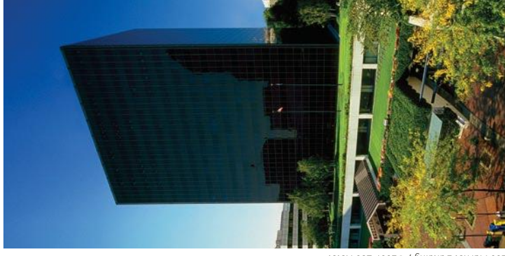
200 Market Building, ©2007 Leo Kettel