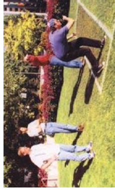
Employees enjoying rooftop bocce ball

Though a growing number of studies support the premise that better IEQ results in improved worker productivity, few cases have proved that this factor has a direct impact on asset value. What is most relevant to the investor, valuer, or underwriter assessing a non-owner-occupied commercial property is whether the potential benefits