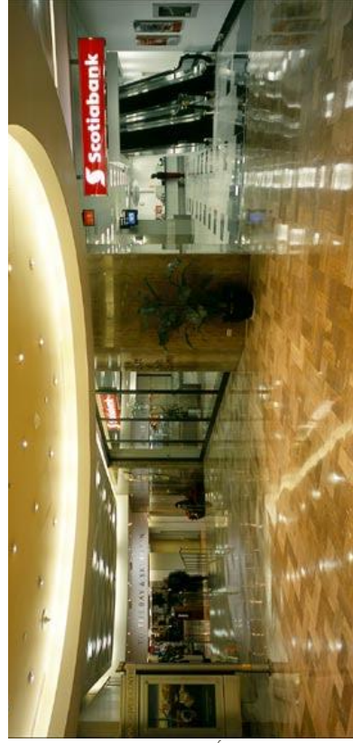
Vancouver Centre lobby

Following an interview with the buyer, it was determined that the purchase price did not reflect the savings or the capital value of the savings from the upgrades. The purchase price was reduced by the cost of the upgrades. Therefore, it is important to determine how sustainable attributes impact savings, capital value, and cost. Another important factor is determining the lessons that can be learned regarding broader sustainability and risk, and whether the approach might now be different.